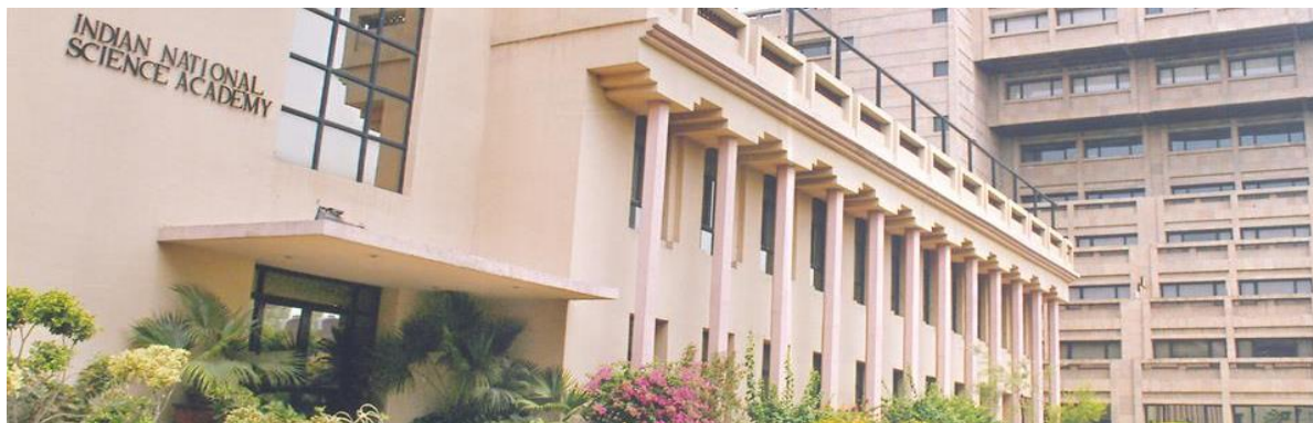
Indian National Science Academy Campus, New Delhi

The eligibility criteria for the participants to attend the programme are as follows: