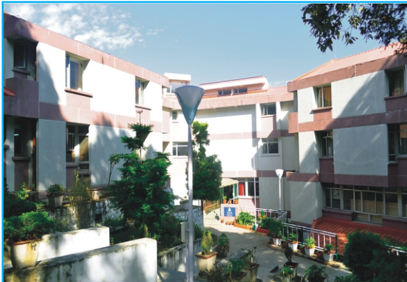
NCGG Mussoorie Campus

NCGG deals with a gamut of governance issues from local, state to national levels, across all sectors. The Centre is mandated to work in the areas of governance, policy reforms, capacity building and training of civil servants and technocrats of India and other developing countries. It also works as a think tank of the Government of India.