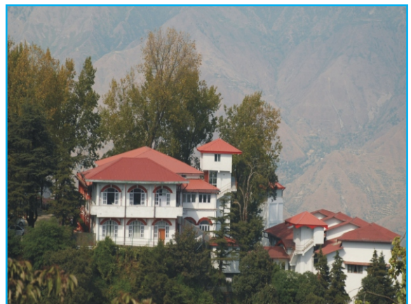
NCGG Mussoorie Campus

Based on the need of various developing countries, NCGG designs and conducts comprehensive capacity building and training programmes for the civil servants of respective countries with the support of the Ministry of External Affairs, Government of India. The modules are developed in close collaboration with the concerned countries and Indian missions to meet their developmental needs. The capacity building and training programmes on public policy and governance are also conducted for civil servants of India to enhance their capacity for good governance and service delivery.